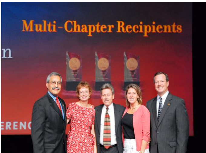
The three Michigan chapter presidents receive multi-chapter Helen M. Yerger special recognition awards for the Fall Conference and the University Project (pilot certification project). Pictured (l-r):