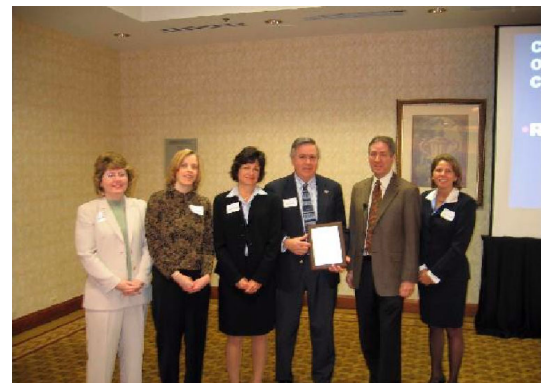
March 23 Meeting